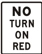
R10-11A 18"X24" 24"X30"