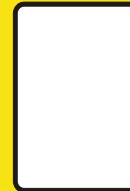
R7-113 12"X18" 18"X24" 24"X30" 30"X36" 36"X48" (Please Indicate Border Color)