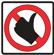
R9-4A 24"X24" 30"X30"