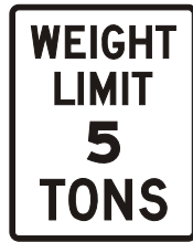
R12-1 12"X18" 18"X24" 24"X30" (SPECIFY WEIGHT)