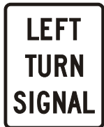
R10-10 18"X24" 24"X30"