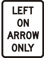
R10-5 12"X18" 18"X24"