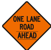
W20-4 36"X36" 48"X48" (Specify AHEAD or a Distance)