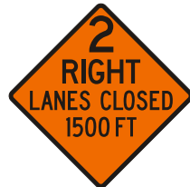
W20-5(3) 60"X60" (Specify RIGHT, LEFT and AHEAD or a Distance)