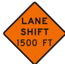
W20-5(6) 48"X48" (Specify Distance)