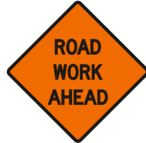
W21-4 24"X24" 30"X30" 36"X36" 48"X48" (Specify Distance)