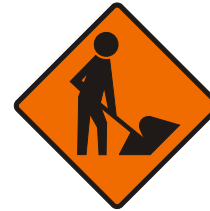
W21-1A 30"X30" 36"X36" 48"X48"