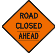
W20-3 36"X36" 48"X48" (Specify AHEAD or a Distance)