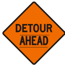
W20-2 36"X36" 48"X48" (Specify AHEAD or a Distance)