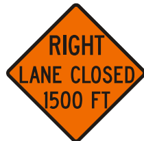
W20-5(1) 36"X36" 48"X48" (Specify RIGHT, LEFT, OR CENTER and AHEAD or a Distance)