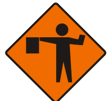
W20-7A 36"X36" 48"X48"