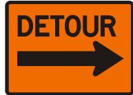
M4-9R (Shown) M4-9L 30"X24"