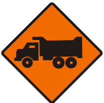
W8-6A 24"X24" 30"X30" 36"X36" 48"X48"