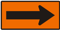
W1-6L W1-6R (Shown) 48"X24"