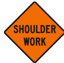
W21-5 24"X24" 30"X30" 36"X36" 48"X48"