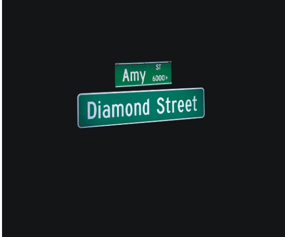
Top: Engineer Grade Sheeting, 4" copy. Bottom: High Intensity Grade Sheeting, 6" Copy.

Street name signs are available single faced or double faced. They are assembled with Engineer grade, High Intensity, or VIP Diamond grade reflective sheeting on extruded or flat aluminum blades. Standard colors are white copy on green background, white on blue, white on brown or black on white. Other colors are available upon request. Custom decals may also be applied to your street signs. These decals may be printed with custom art to represent your city, county, or civic organization. The MUTCD recommends using 6" letters on 9" street signs.