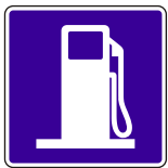
D9-7 18"X18" 24"X24"