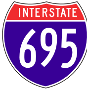
M1-1 24"X24" (2 Digit) 30"X24" (3 Digit)