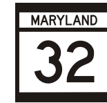
M1-6 24"X24" 30"X24" 36"X36" 48"X48"