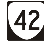
M1-6V (VA Spec) 16"X16" 18"X18" 24"X24"