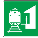
I-7 24"X24" 30"X30"