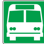
I-6 24"X24" 30"X30"