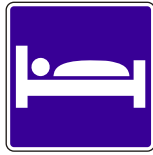
D9-9 18"X18" 24"X24"