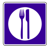
D9-8 18"X18" 24"X24"