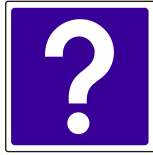
D9-10 18"X18" 24"X24"