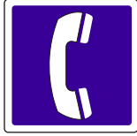
D9-1 18"X18" 24"X24"